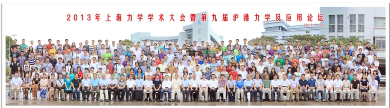
Photo 9: The morning session of the forum.