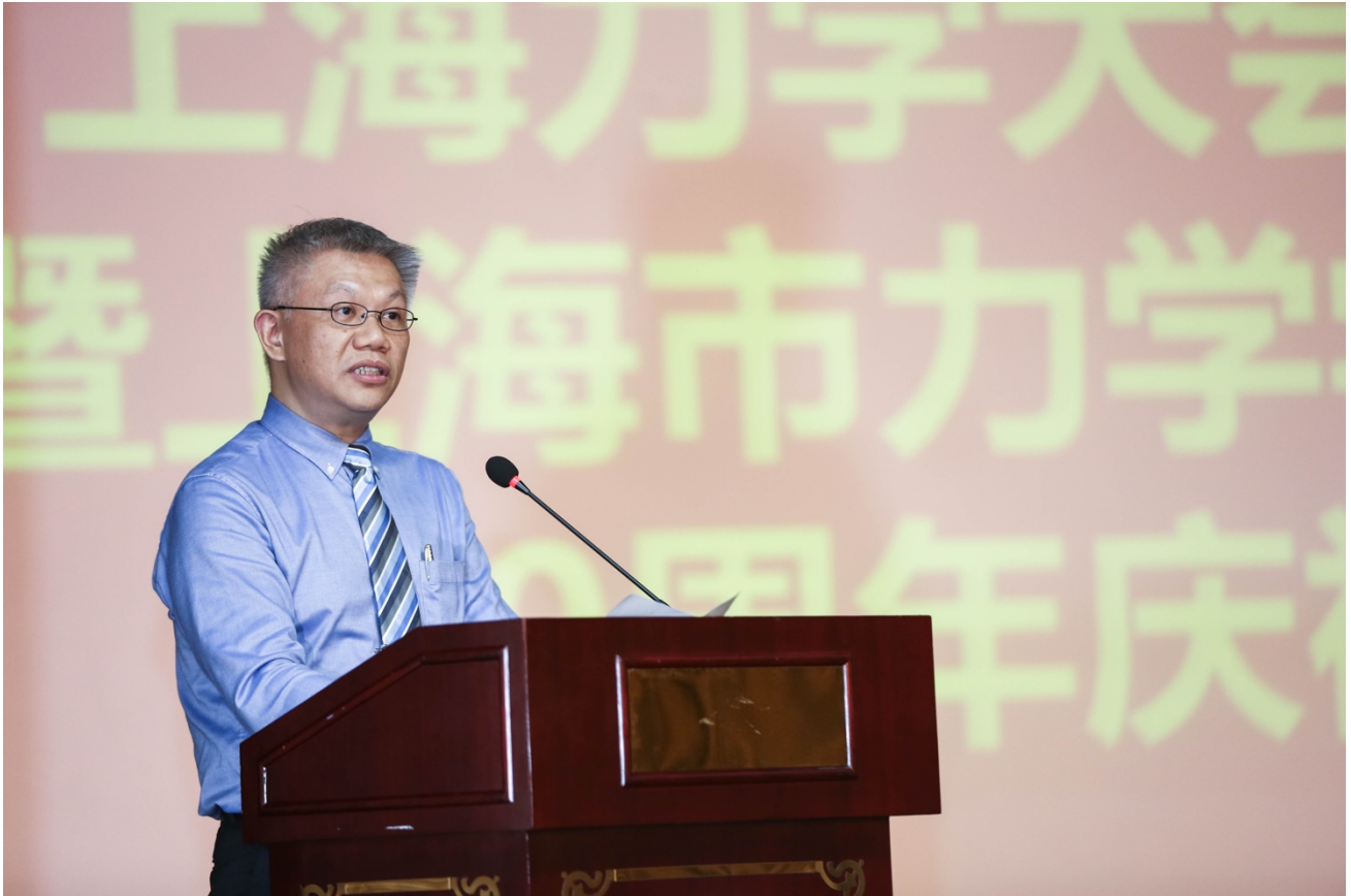
Figure 2: Opening address in the 上海力学大会2019 by Ir Prof Paul Lam.

the opening addresses (開幕式) in this conference on behalf of the HKSTAM (see Figure 2). Figure 3 shows the souvenir exchange between HKSTAM and JSSTAM. Prof Li Cheng gave an invited seminar (特邀報告) under the topic of “Recent Advances in Acoustic Black Hole Research”.