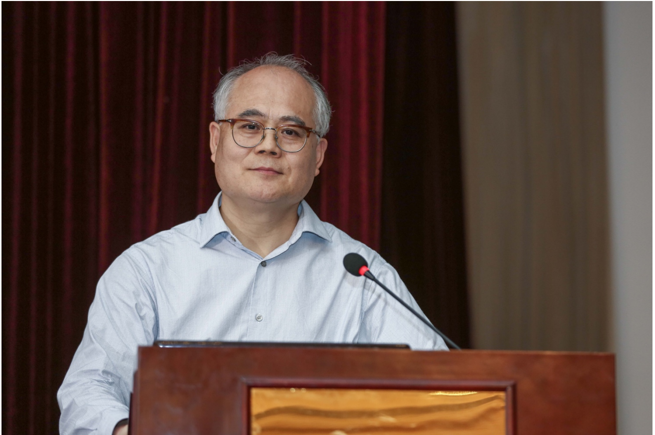
Figure 3: The invited seminar by Prof Li Cheng.